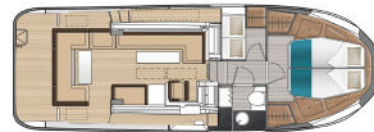
Lower deck - 2 cabins / 1 head