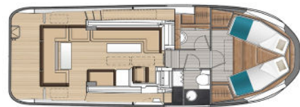
Lower deck - 1 cabin / 1 head