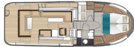
Lower deck - 2 cabins / 1 head