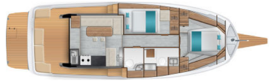
Lower deck - 2 cabins / 2 heads